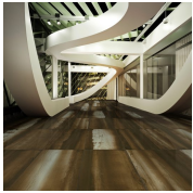
Metal 2.0 Apavisa