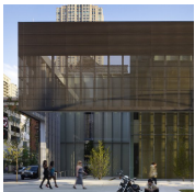
Wall Panels - Corrugated VMZINC