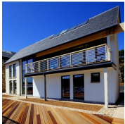
Natural Slate CUPA 3 Cupa Pizarras