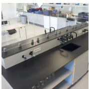
Max Resistance 2 FunderMax